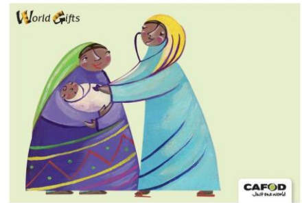
The gift of mother and baby care

World Gifts make a huge difference to people living in poverty, from education gifts of school starter packs to livelihood gifts of piglets and cows - World Gifts are life changing.