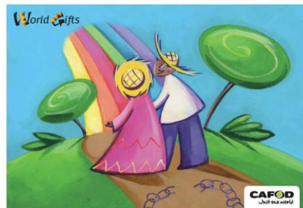
The gift of refuge

We can give new hope to the poor of the world, And the chains of debt we can release. We can give new seeds and the water of life, And with hand in hand, travel in peace, To greet the Lord of the earth, The new-born Lord of the earth!